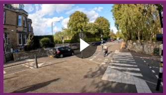
Timelapse Video (Youtube) - 26 Aug 2025 - Looking North-east