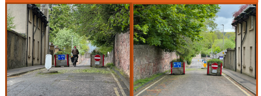
Looking North Looking South