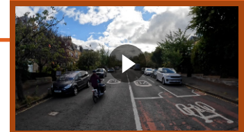
Timelapse Video (Youtube) - 2nd Sept 2025 - Looking South