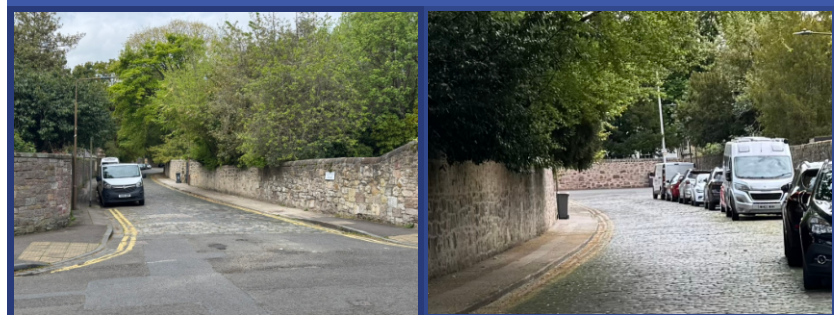
Looking West Looking East