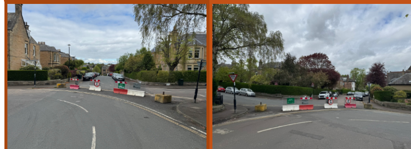
Looking North Looking South-west