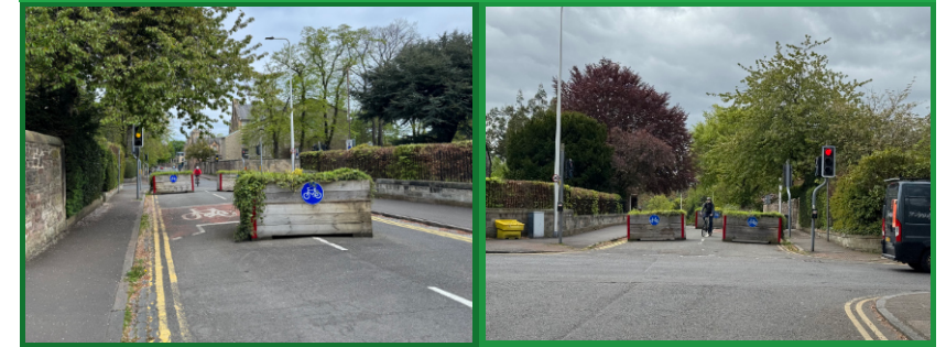
Looking North Looking South