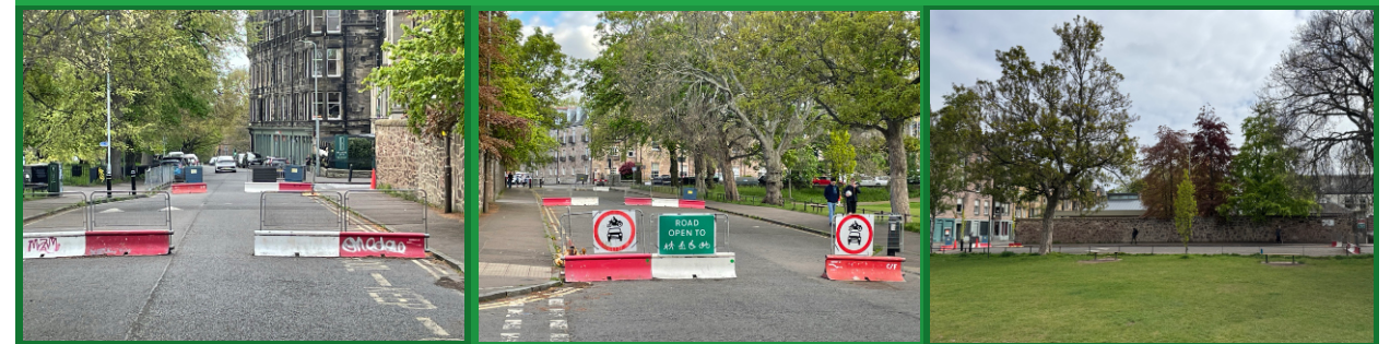
Looking North Looking South Looking East