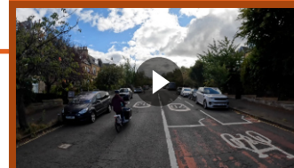
Timelapse Video (Youtube) - 2nd Sept 2025 - Looking South