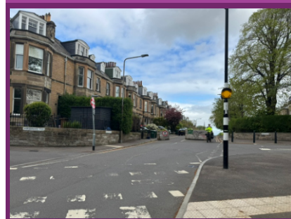
^ Looking North