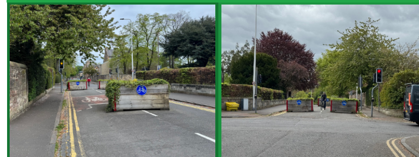
^ Looking North ^ Looking South