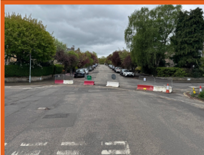
^ Looking South