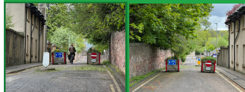
^ Looking North ^ Looking South