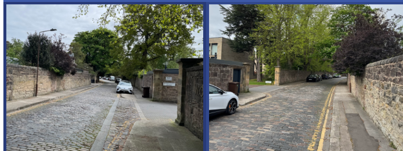
^ Looking East ^ Looking West