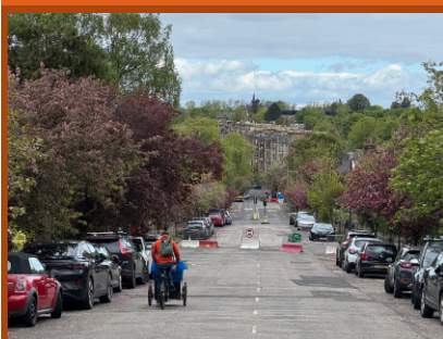
^ Looking North