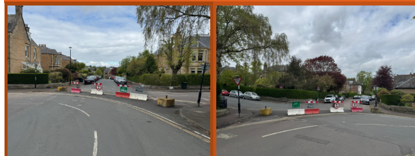
^ Looking North ^ Looking South-west