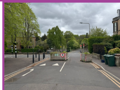
^ Looking South