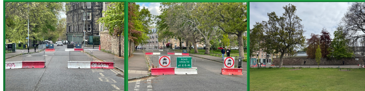
^ Looking North ^ Looking South ^ Looking East